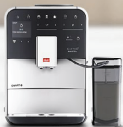
Barista TS Smart® silver/black