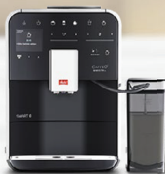
Barista TS Smart® black