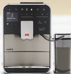
Barista TS Smart® Stainless steel